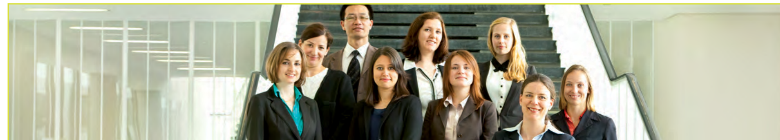
The NFG Research Group