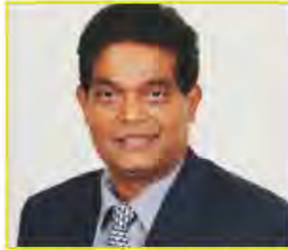
Amitav Acharya, Professor of International Relations

This report provides a comprehensive overview of the research, empirical findings, and lessons learnt in applying the unique modus operandi of the NFG in three parts: the project synopsis, main findings, and outlook for research and policy. Within the synopsis part, the project description outlines the main research goals of the NFG and their operationalisation within an intercultural and interdisciplinary team. Core findings – part II – result in recommendations for future academic research, for decision-makers and the policy community (part III).